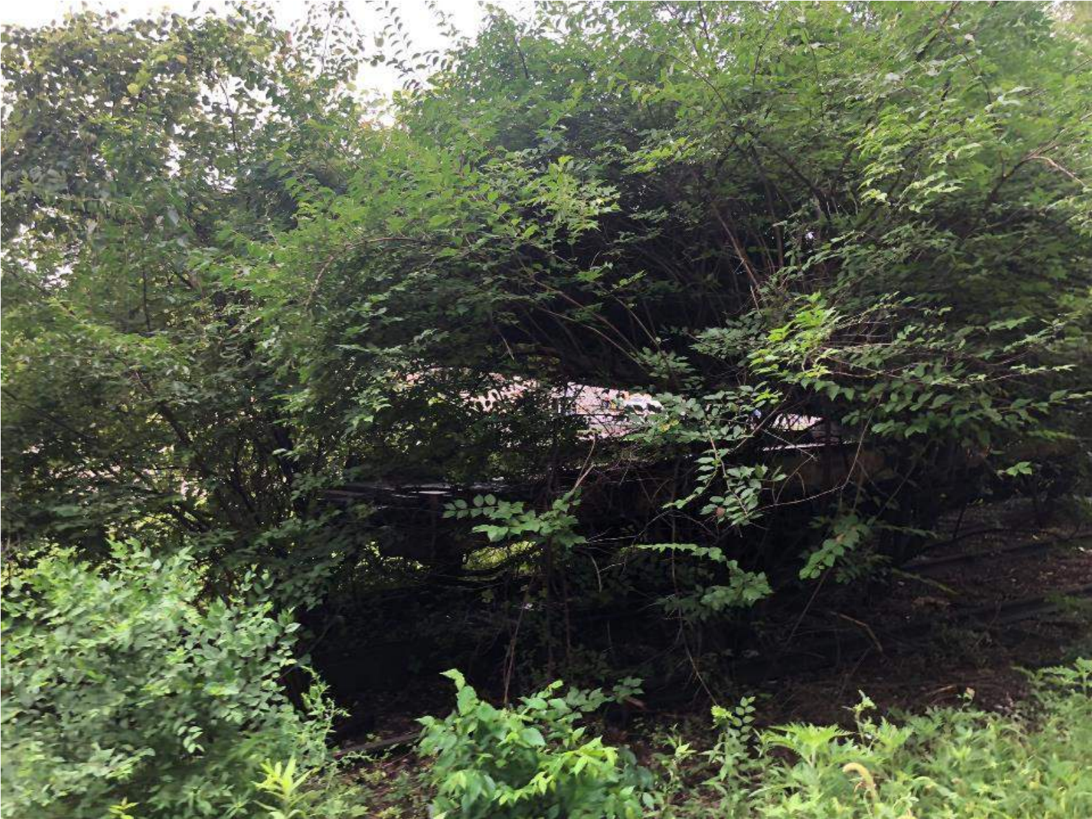
North end looking easternly.