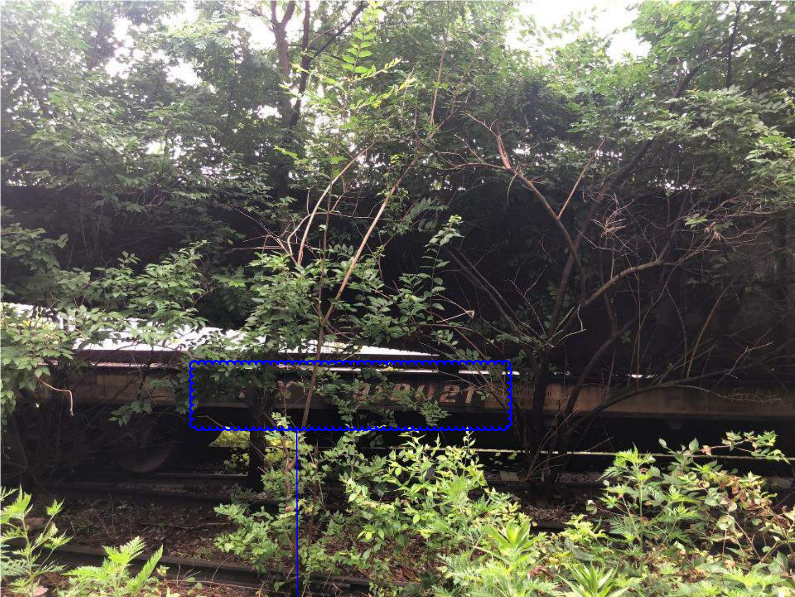
WTTX 912021 Same as other side.