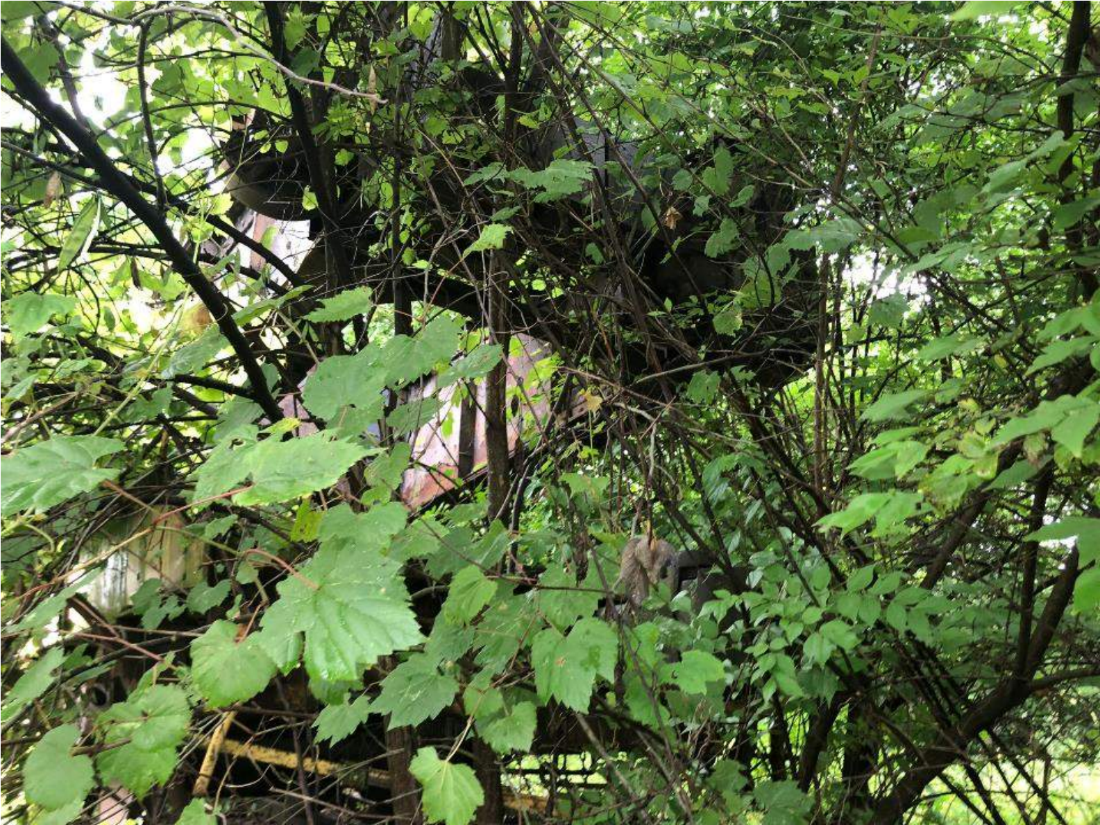
North end of turn table. Looking southwest.