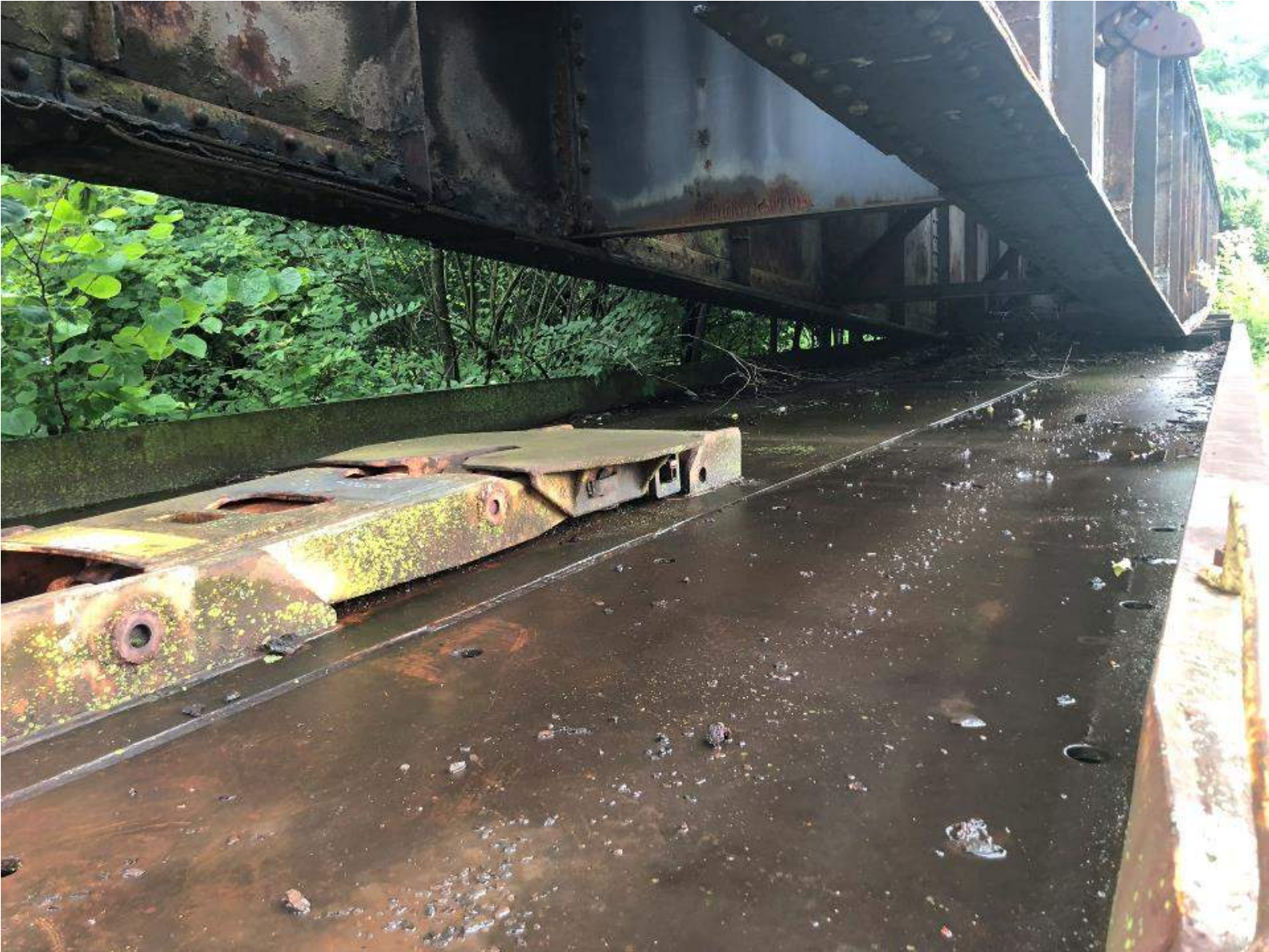
South end, Looking north across the Rail Car deck (steel plate)