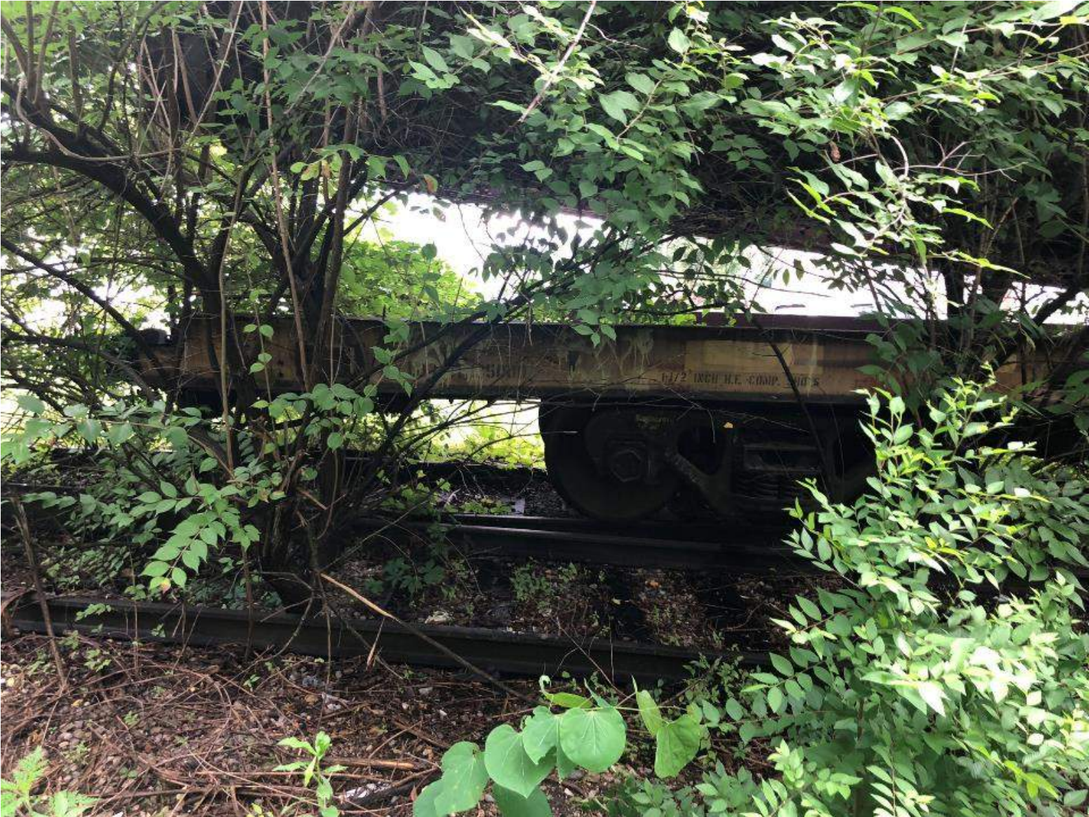
North end of rail car. No distinguishable marking different than eastern side.