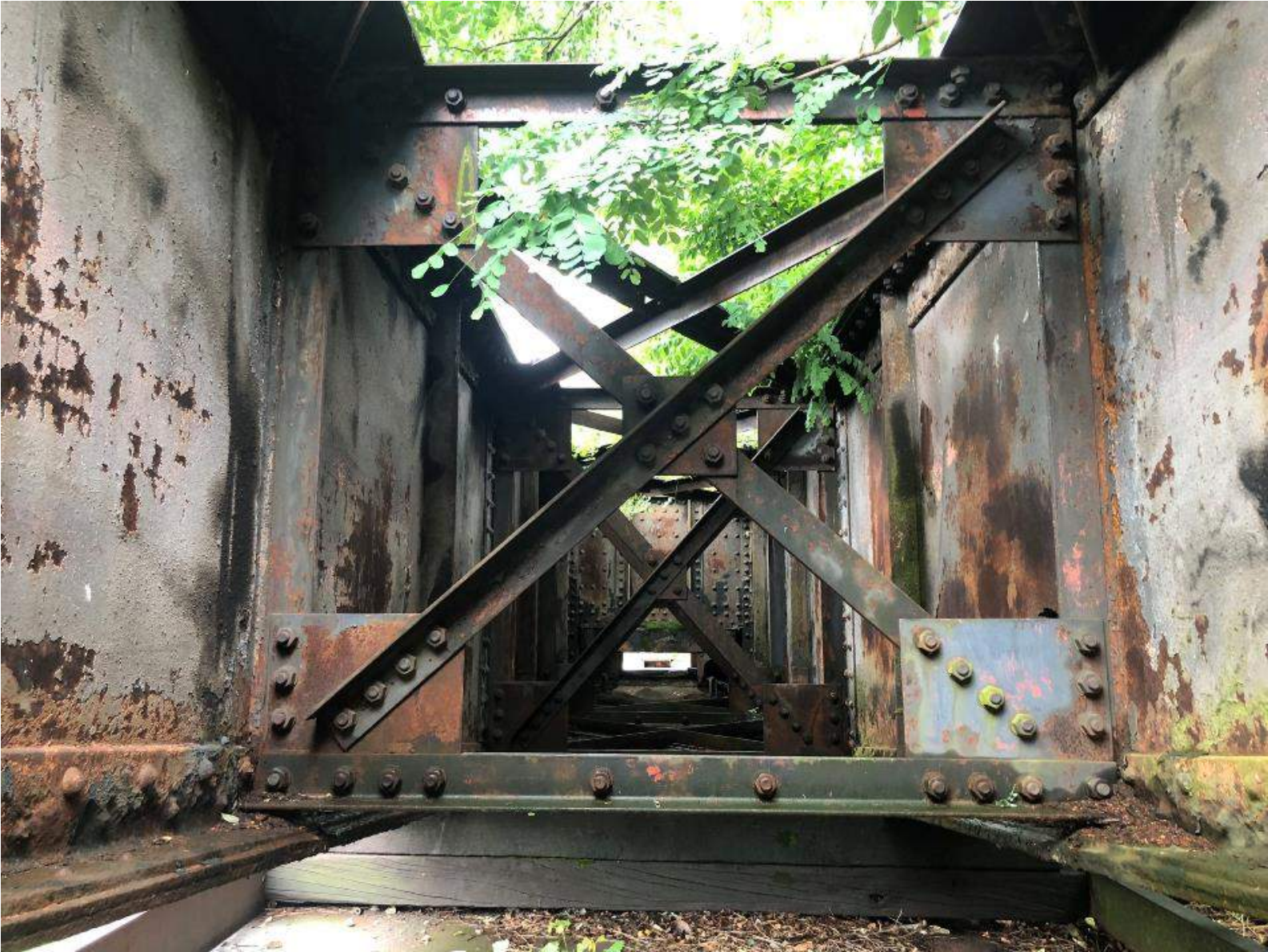
North end of turn table, looking south. Below is rail car.