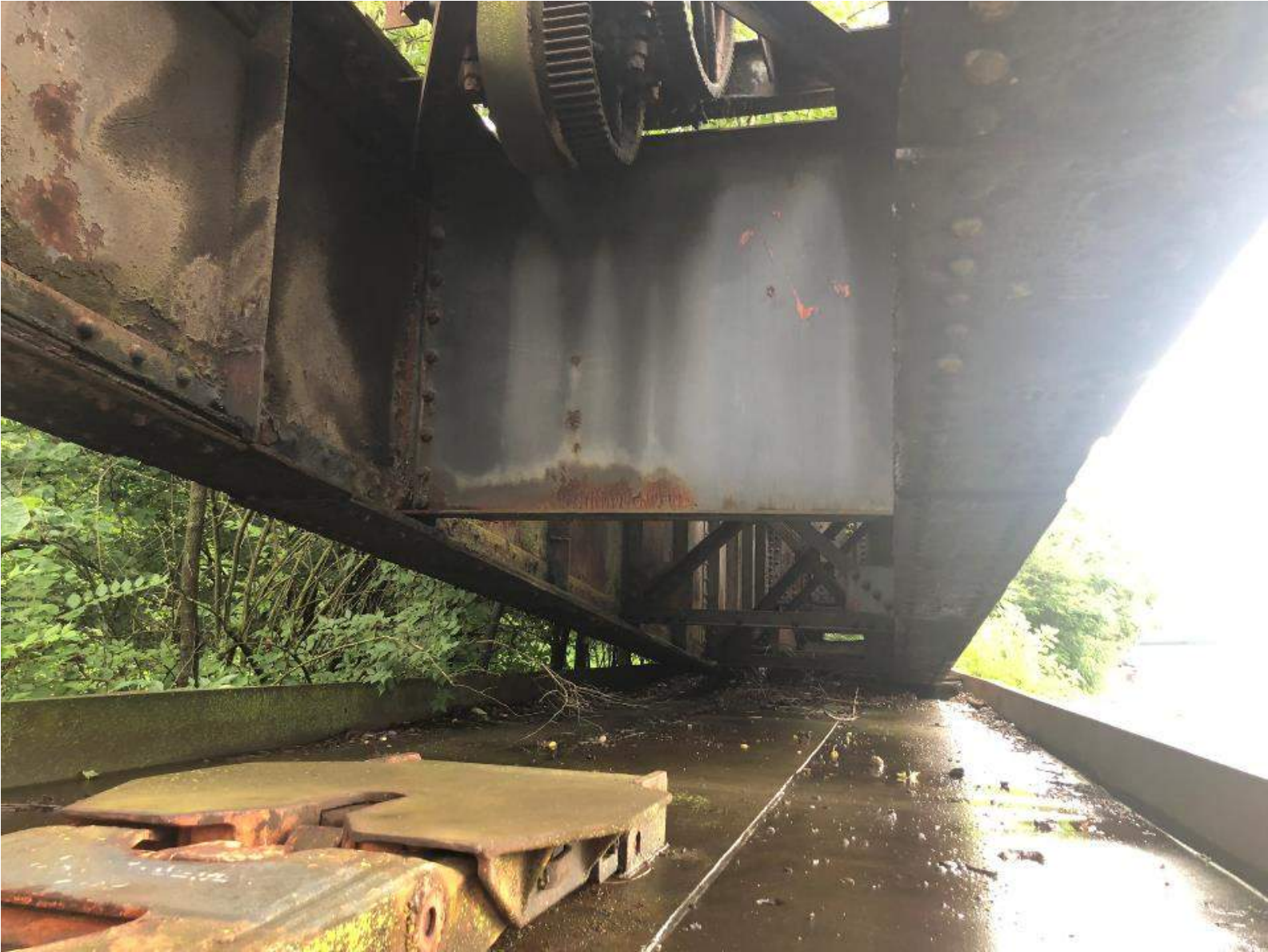
South end, Looking north across the Rail Car deck (steel plate)