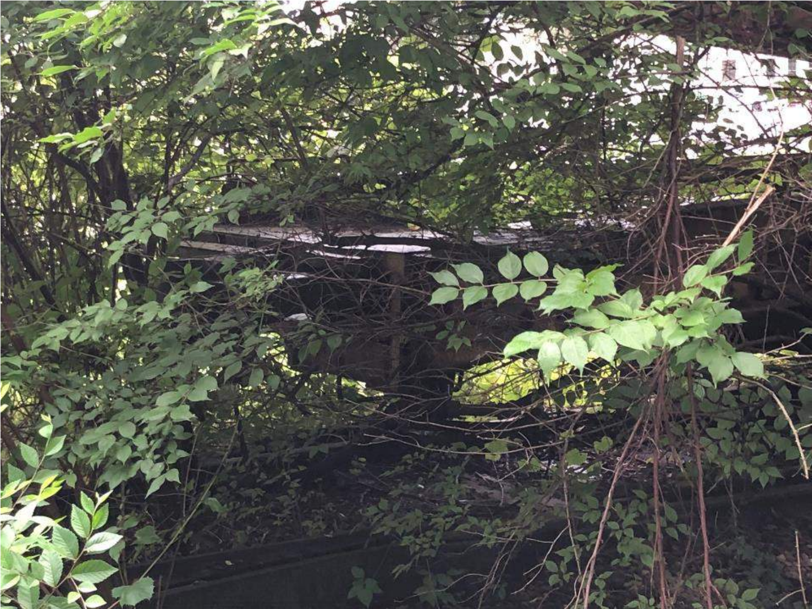
North end of rail car