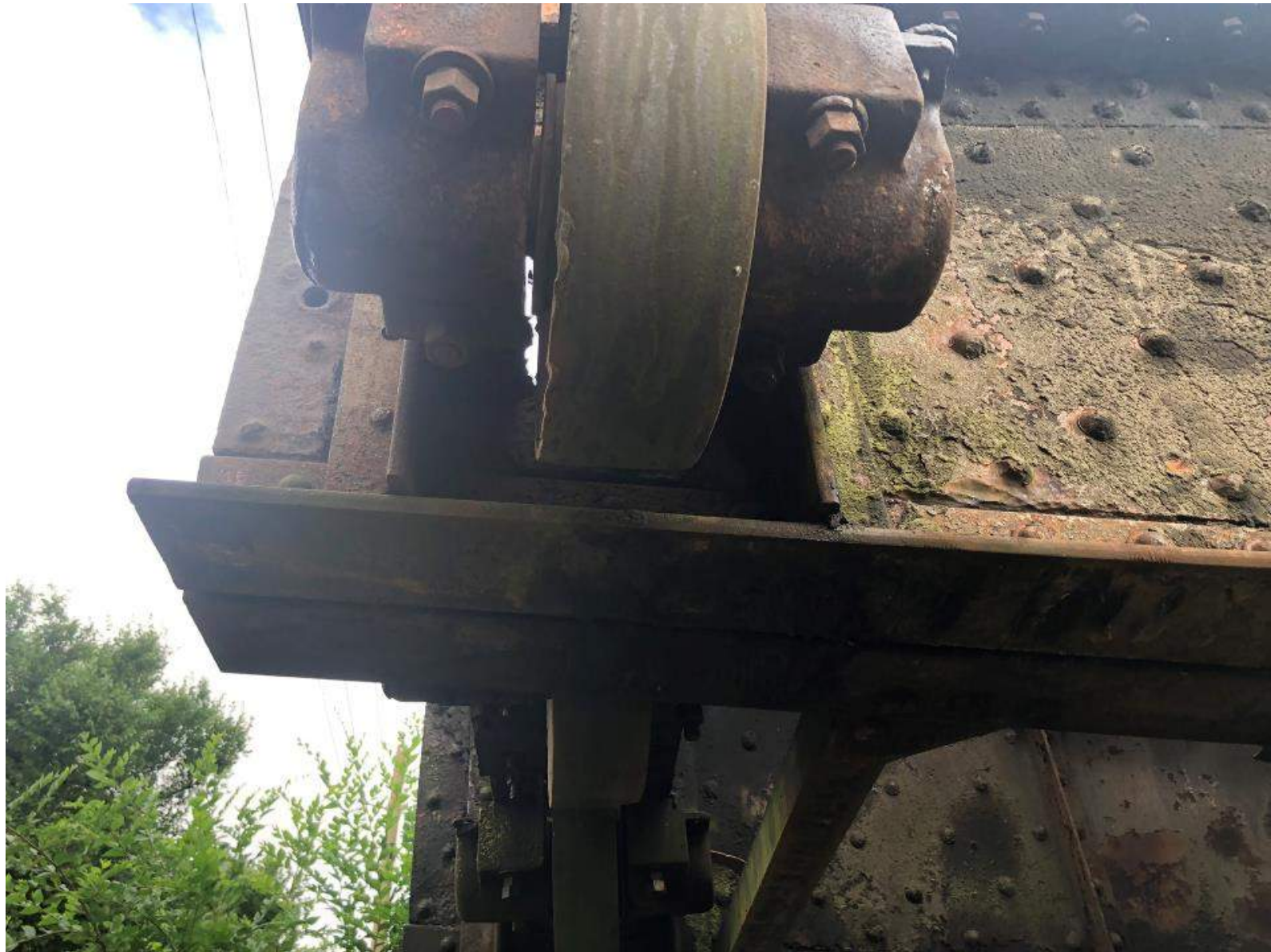
South end of turn table.