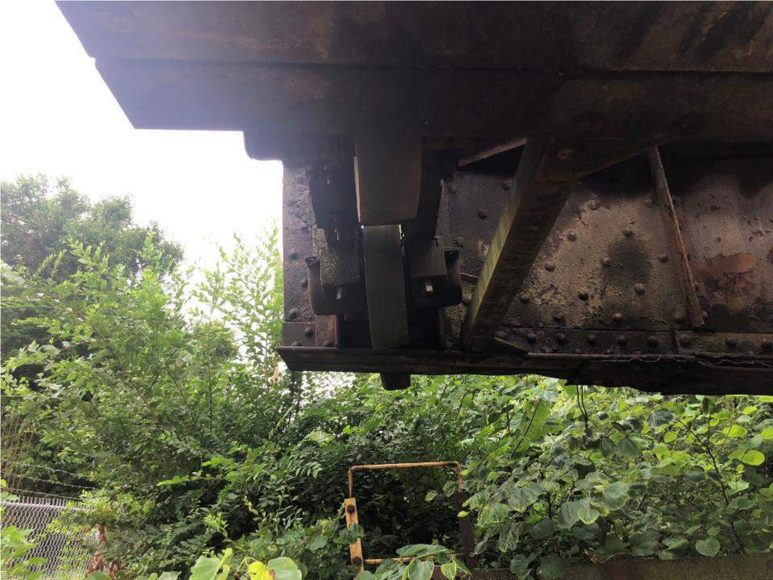
South end of turn table.