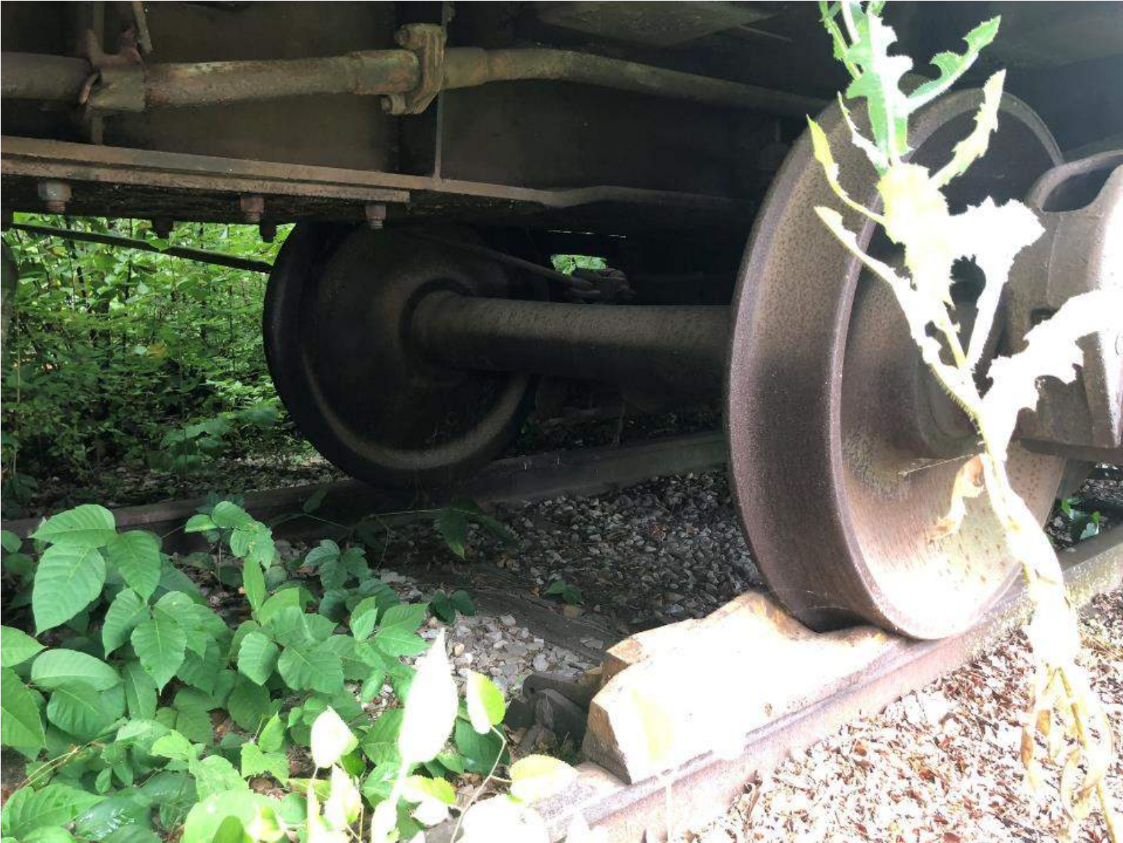
South end of rail car. Blocked wheel.