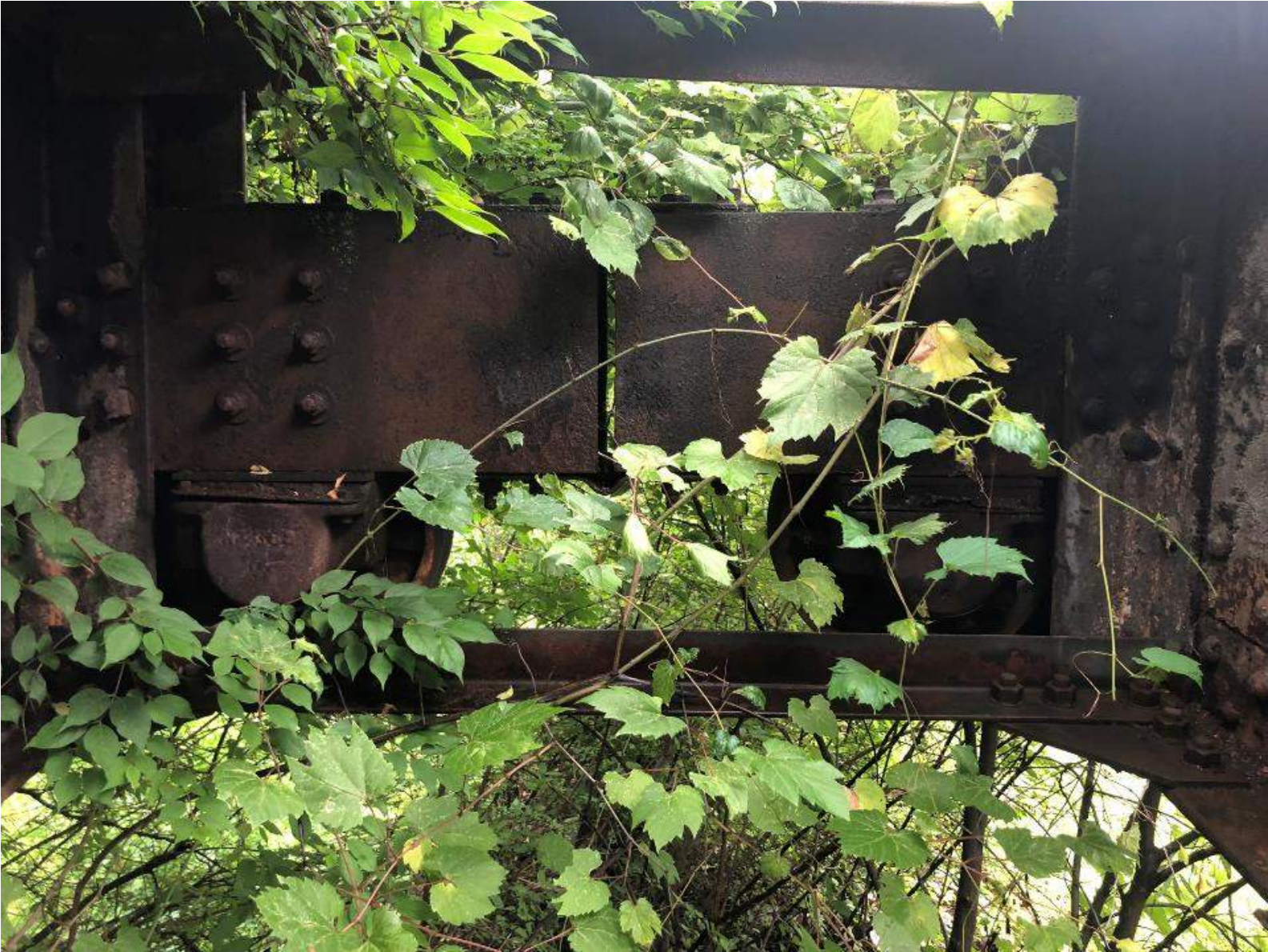
North end of turn-table, looking north.