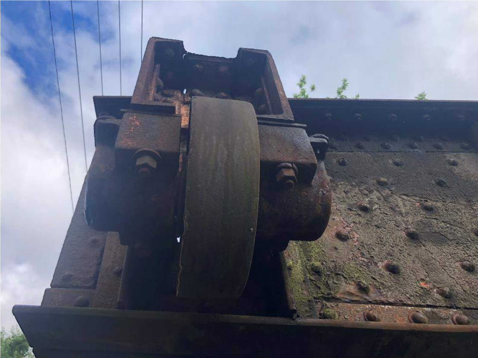
South end of turn table.